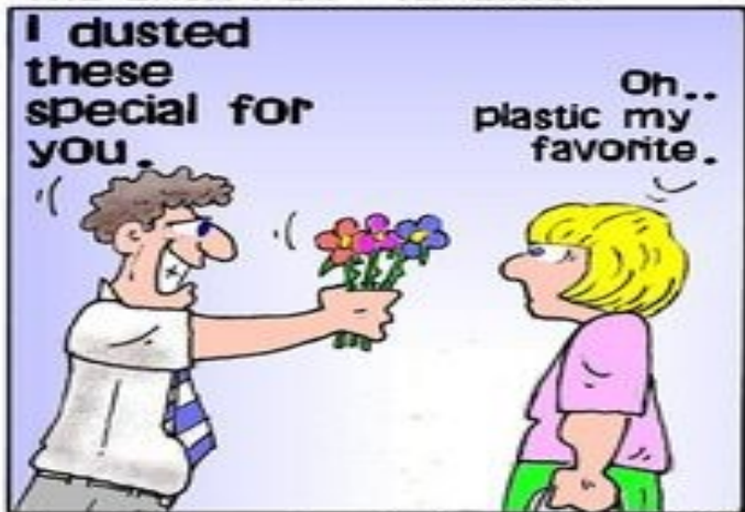
A way to a woman's heart.. FLOWERS! .. Pst.. real ones