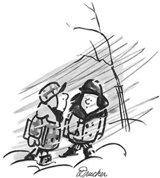
"I can see why they made February the shortest month of the year."