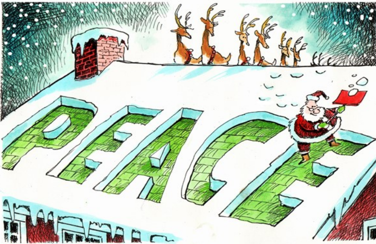
DAVE GRANLUND © www.davegranlund.com